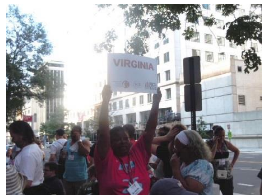
National ADA Rally in Washington DC