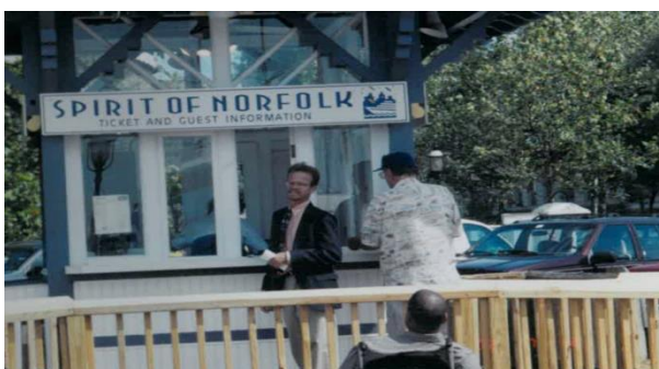
The Youth Advocacy Group advocated for accessible Spirit of Norfolk ticket booth

Disability advocates across the United States have been sponsoring events to celebrate this anniversary of passage of the ADA on July 26, 1990.