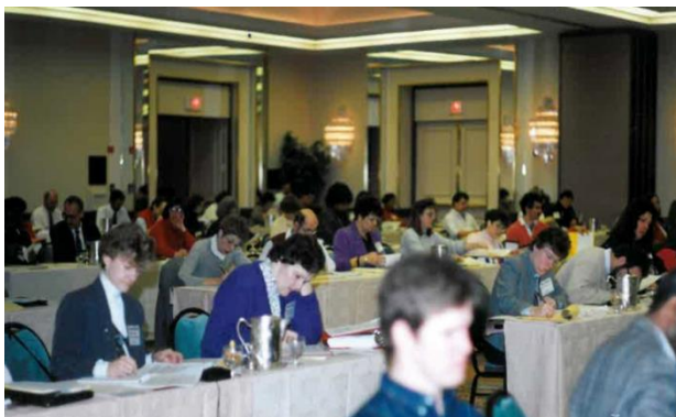
ECI conducted the nation's first statewide training on the ADA in 1991 for 60 advocates