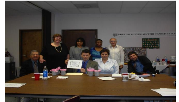
Over the years, delegations from other countries including England, Costa Rica, and Guam were hosted and trained on the ADA