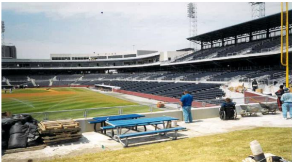
ECI provided technical assistance on ADA accessibility requirements for Harbor Park Baseball Stadium