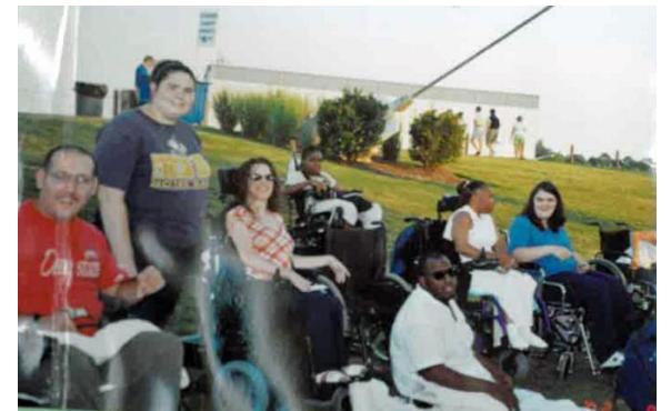
In 2002 Young Advocates began their efforts to make lawn seating at the Virginia Beach Amphitheater accessible

Independent Living Centers from every state sent about 1,000 total representatives to the annual National Council on Independent Living Conference in Washington, D.C., which was dedicated to the anniversary. Large crowds of people with disabilities marched to the Capital where a rally was held featuring speeches by legislators and disability advocacy leaders who had a role in the passage of the ADA. The weeklong conference included many workshops to provide information to the community about the ADA as well as celebratory activities during the conference.