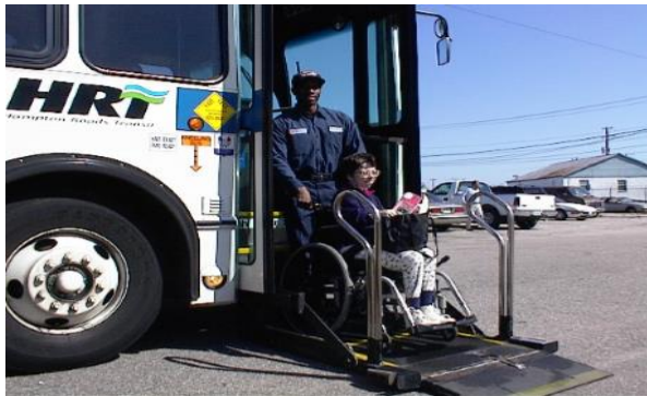
ECI provided information and training so that people with disabilities had accessible buses