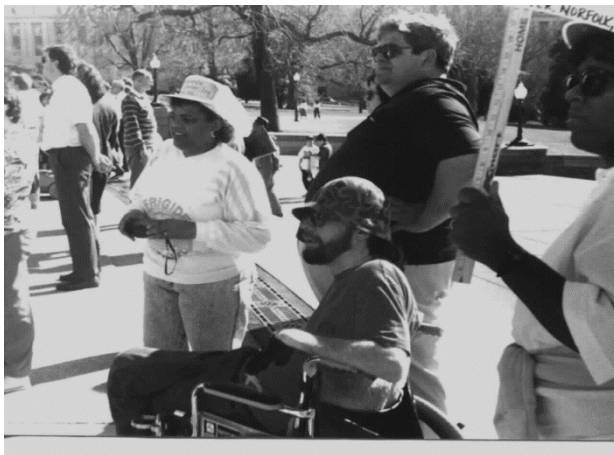
Staff and participants at an ADA pre-signing rally in Washington, DC in 1989

The Endependence Center, Incorporated (ECI) is a consumer-controlled, community-based, cross-disability, non-residential, private, non-profit Center for Independent Living (CIL) operated by and for people with disabilities in South Hampton Roads. The purposes of ECI are two-fold: to prepare individuals, and to prepare the community for full integration of people with disabilities into society.