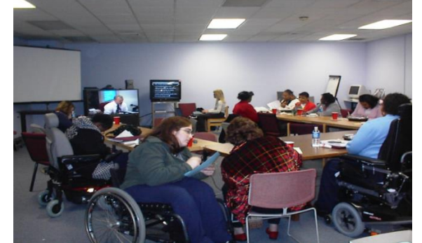
Community members, participants and staff came together in an "Ask the Experts" ADA teleconference hosted in 2003