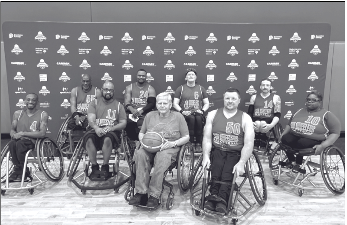
Pictured above: Team photo of the Sun Wheelers Wheelchair Basketball Team. The photo is of eight players and one coach, all wearing basketball jerseys and using wheelchairs.

The Virginia Sun Wheelers (local wheelchair basketball team) has been invited to compete in the 2025 Wheelchair Basketball National Tournament. Held over the first two weekends in April, the Championships will be at the Henrico Sports & Event Center in Henrico, Virginia. More information about the tournament will be posted on the ECI website and Facebook.